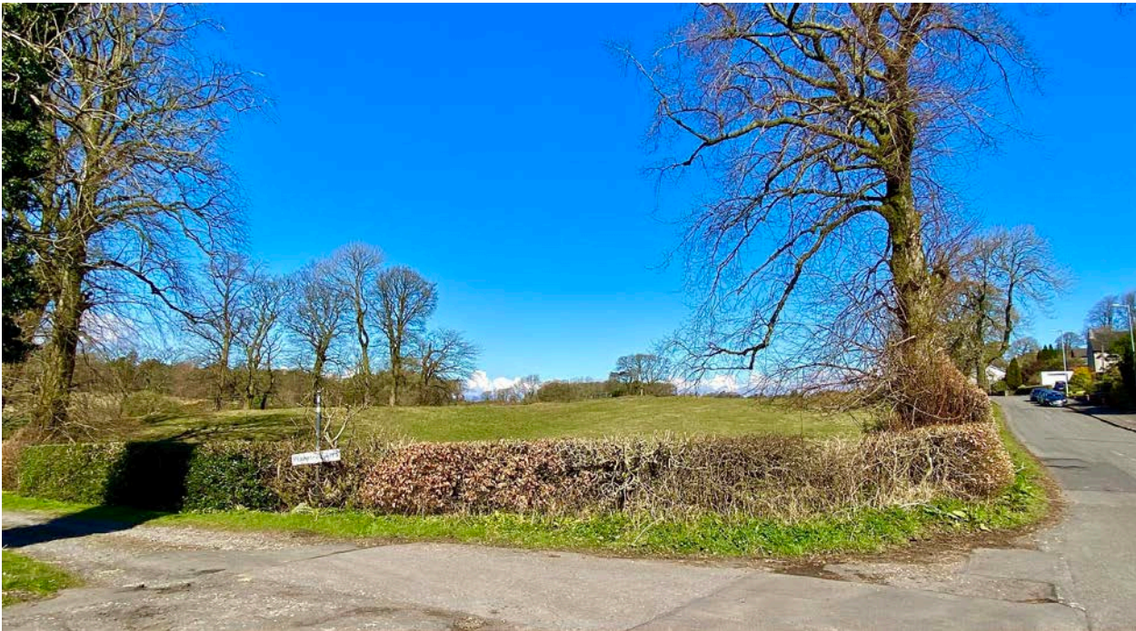
Looking north from Finlaystone Road adjacent to the junction with the access road to Planetreeyetts

SPP advises on the spatial form of the Green Belt and sets out that clearly identifiable visual boundary markers based on landscape features should be established. Whilst only considered in principle, the applicant's supporting documentation gives a flavour of the overall development concept for the site. The new Green Belt would be defined by rear gardens and new planting rather than established natural or physical markers. Any proposed new planting to the edge of the new development would take some considerable time to mature. However, it is recognised that when long established and clearly defined, physical boundaries which are strengthened by robust landscape features including trees and hedges can establish to form a robust and defensible Green Belt boundary.