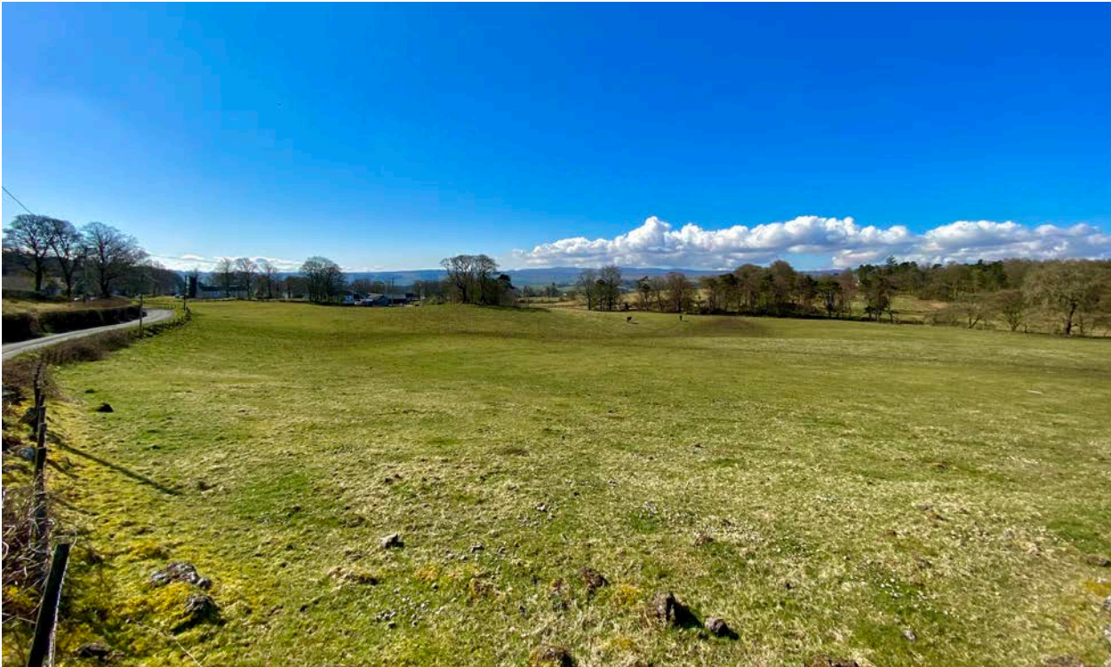
Looking south-west across the site from adjacent to Finlaystone Road

As part of plan-led approach, the proposed LDP process considered the requirement and, through a site selection process, concluded that the application site was not required to address this shortfall. The Board considers that it remains that additional investment in new housing should be centred on locations that have greater potential to result in modal shift or improved transport outcomes that better reflect the principles of sustainable development. This would include the Bishopton community growth area identified within Clydeplan which is also situated within the Renfrewshire Housing Sub-Market Area. Given the limitations in the accessibility of the application site without the reliance on the use of the private car, the Board considers that the proposal to develop a site which is not part of a land release and planned expansion of the settlement of Kilmacolm identified through a plan-led system would not constitute low carbon placemaking at this time. Accordingly, the development would be inappropriately located and, as such, contrary the Vision and Spatial Development Strategy within Clydeplan, Policy 10 of the LDP and Policy 11 of the proposed LDP.