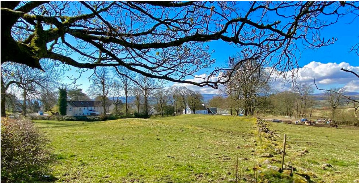
Looking south-west towards Planetreeyetts Farm.

A range of traffic and road safety concerns have been raised in the public objections, however the Head of Service – Roads and Transportation raises no concerns regarding any knock-on effect in respect of parking within the village centre or at the local primary school. Whilst construction traffic will inevitably travel to the site via the local road network, this does not warrant the refusal of the application, as is also the case with concerns over existing road surface conditions and the wider road network within West Central Scotland.